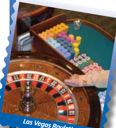
Las Vegas Roulette

All tours include round trip motorcoach transportation, lodging, driver & escort tips, and admission to listed attractions when applicable.