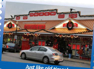
Just like old times!

Relax aboard the motorcoach as we make our way home today. On the way, stop at Marshall Pottery, which specializes in hand turned pottery straight from the potter’s wheel.